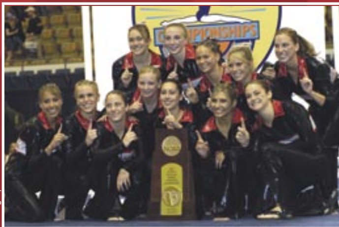
University of Georgia Women's Championship Team