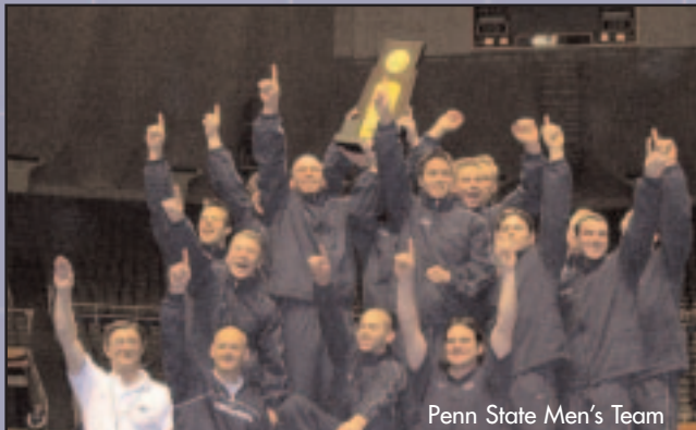
Penn State Men's Team

Penn State came into the Men's NCAA Championships ranked third but left University of Illinois' Assembly Hall as NCAA Champions. The event took place April 2-4 and utilized a podium, a first for the NCAA Championships. The Nittany Lions beat two-time champions Oklahoma and number one ranked Illinois. Penn State finished with a score of 223.350 over Oklahoma's 222.300 and Illinois' 222.225.